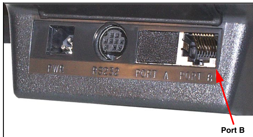
Figure 2-2. Connecting the Ethernet line