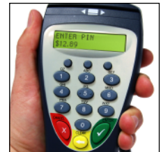
Handy for you and your customers

Hypercom's S9 line: it's the total transaction solution with benefits that you just have to touch to believe.