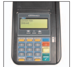
19-key configuration available

The T7Plus is customizable. Its the first of its kind to offer bi-lingual screen displays. Big 5 Chinese and English can be shown simultaneously, meeting the needs of Chinese-speaking merchants and cashiers.