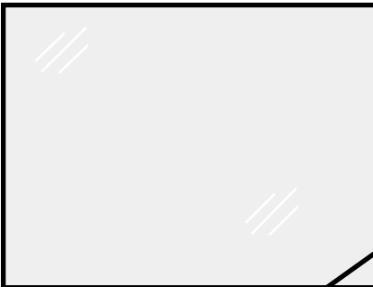
Figure 1 - ICE Terminal Screen Protector

ICE 6000/6500/7000 Series (shown in Figure 1) Part Number 700309-001